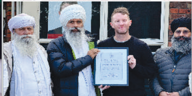
Honored by MP Dylan Wight