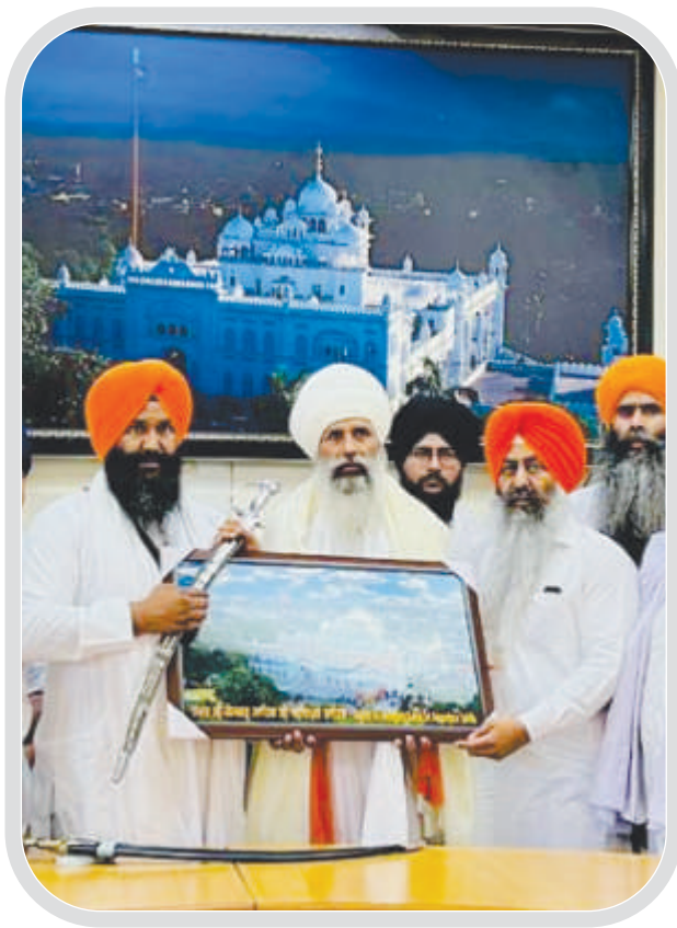
...at Takht Sri Kesgarh Sahib,