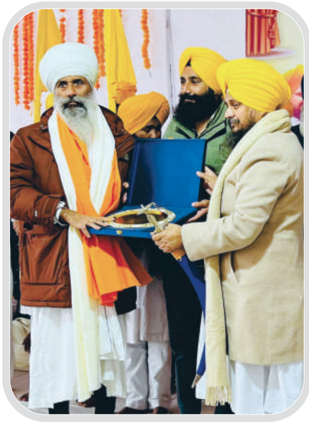
...at Takht Sri Damdama Sahib