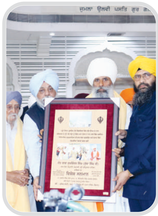
...at Takht Sri Harimandir Patna Sahib