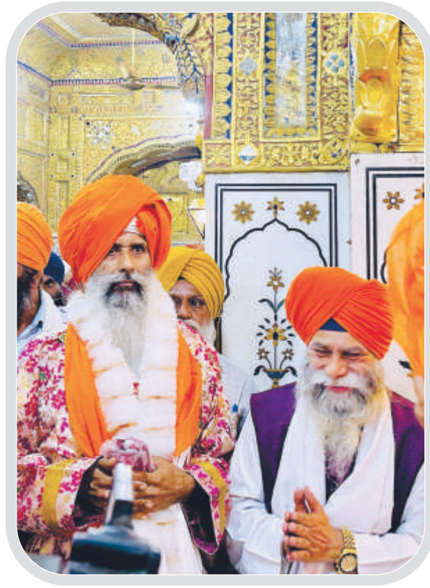
...at Takht Sri Hazur Sahib