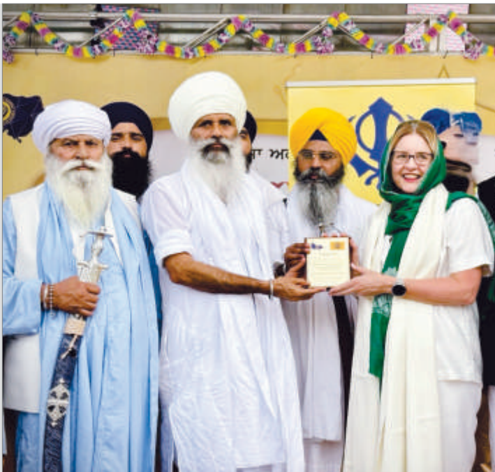
Honored by Jacinta Allan (CM Victoria State, Australia)