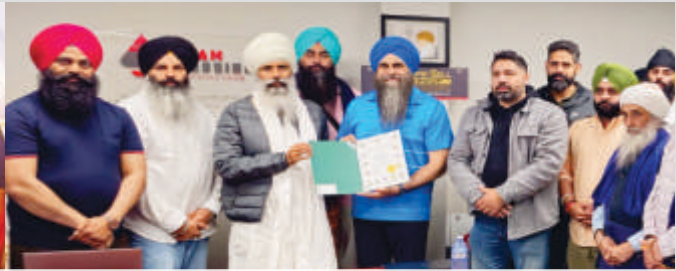
Honored by Ranjit Bath (Director of Edmonton for Conservative Party)